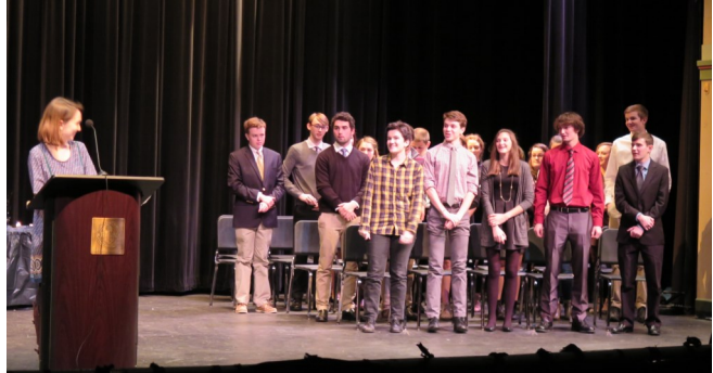
Congratulations to the 26 new members who were inducted into Ipswich High's local chapter of the National Honor Society during the Winter Ceremony.