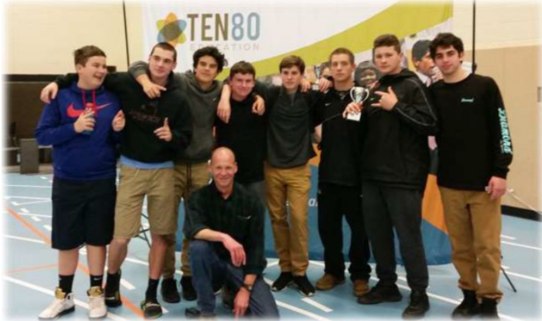
NE Fall Invitational 2016 Grand Champions, Brick Squad Racing, Ipswich High School

On Thursday December 8th, the Ten80 National STEM League 2016 New England Fall Invitational was held at Ipswich High.