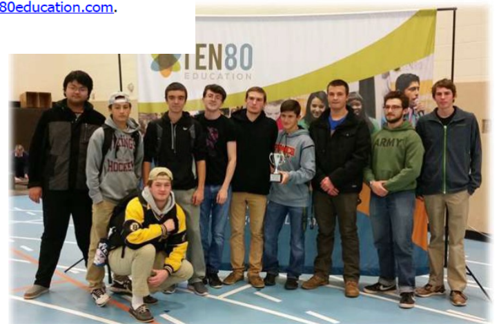
Second Place Overall, Rippin' Racin' Ipswich High School

If you are unsure whether or not you have paid your class dues, contact your class officers or advisors.